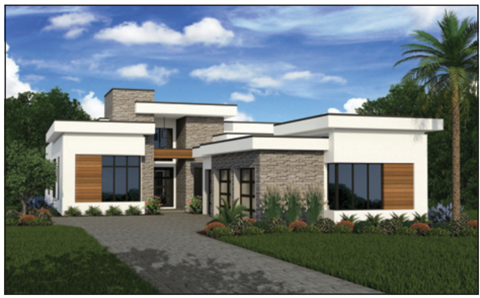
Arthur Rutenberg Homes/Lyons Housing