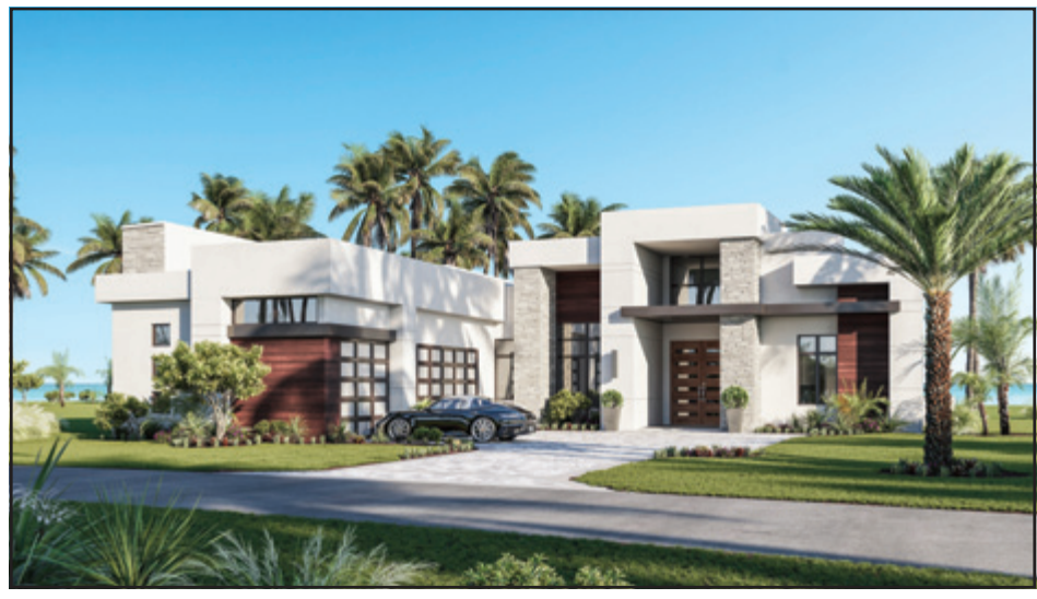
Seagate Development Group